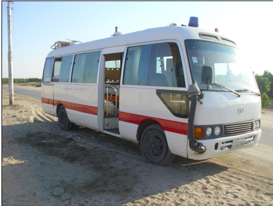
Ambulance that Brought 7 Bodies to Cemetery for Burial – 9-10-2011