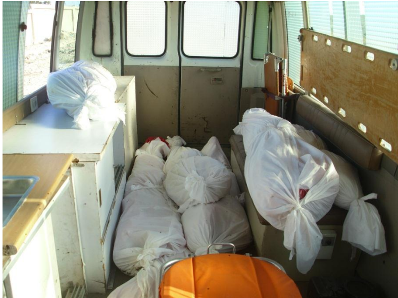
Bodies Ready for Burial – 9-10-2011